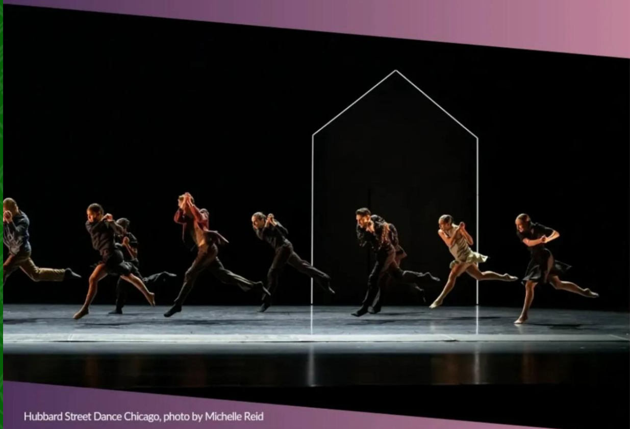
Hubbard Street Dance Chicago