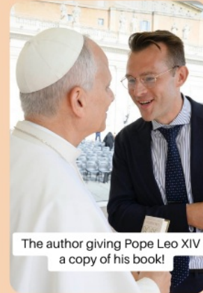
The author giving Pope Leo XIV a copy of his book!