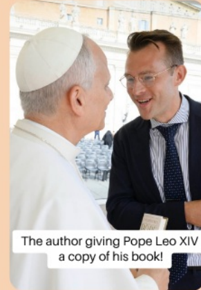
The author giving Pope Leo XIV a copy of his book!