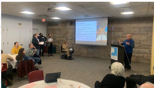
The St. Paul's Pastoral Council

May the Holy Spirit guide our parish always,