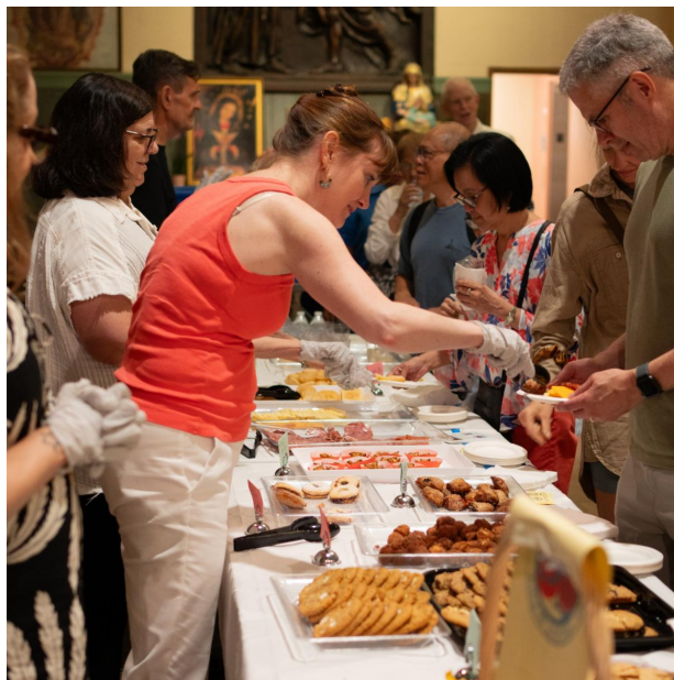
The Hispanic community threw an awesome party in the Parish Center after the 12:30 PM mass!