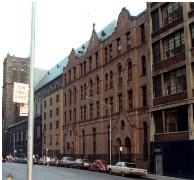
St. Paul the Apostle Reunion

As we enter into the Easter Triduum, we pray for radical hope in the face of despair. Like the disciples who saw Christ crucified on Good Friday, we mourn when we contemplate the myriad challenges facing the planet and the irreparable harm that has already been done. Yet we will soon experience the miracle of the Lord's Resurrection and ask to be strengthened by our faith that, with God, nothing is impossible. Let us greet the Risen Christ with joy, wonder, awe, and humility, and may we carry that spirit of renewal forward with us, encouraging our actions to care for our environment. Let us celebrate together, nurturing our bonds with our families, friends, parish, and wider community and fortifying these connections that will support us when we are discouraged. Let us seek to always cultivate these relationships, at the heart of our Church, and model in our community the ethic of ecological and social care and renewal that we wish to see spread to every corner of our common home.