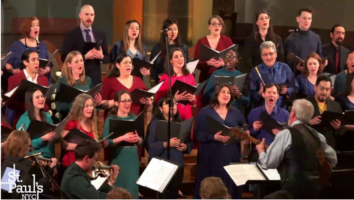
Our Lenten journey began with one last "Evening of Alleluias" from the Notre Dame Folk Choir and a wonderful parish Mardi Gras party.