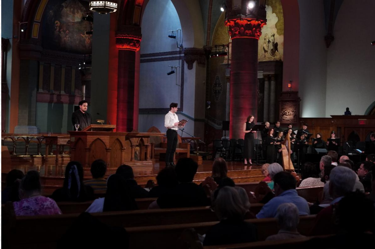
Many gathered later in the day for Tenebrae , an evening of candlelight scripture reflections accompanied by a beautiful string quartet.