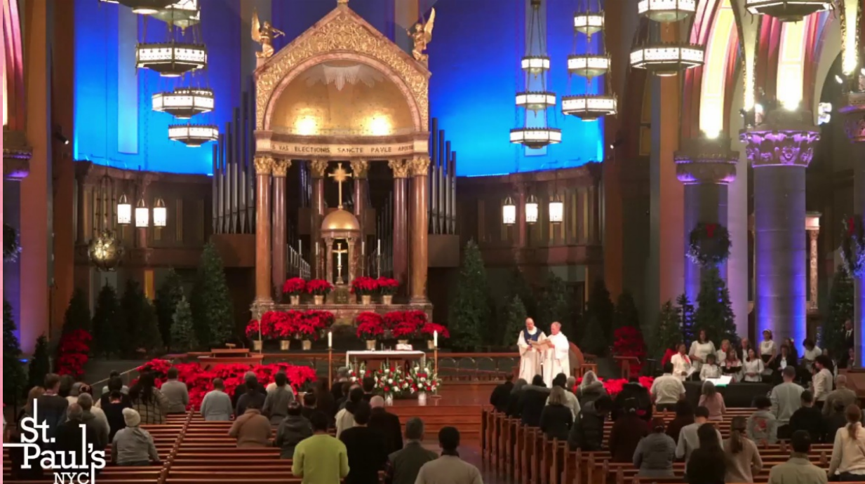
On Tuesday, we had a fantastic, festive celebration of the Feast of Our Lady of Guadalupe. Thanks to all who prayed with us!