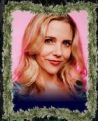
Kerry Butler Beetlejuice