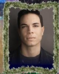
Jason Gotay Gossip Girl

Celebrate the magic that lights up the city at Christmas with 12 Broadway stars, a 25-piece orchestra, and a 70-voice chorus