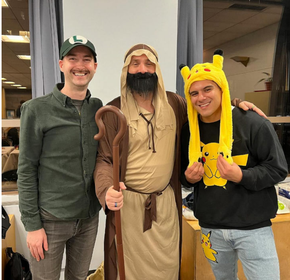
Luigi, Moses, and Pikachu walk into a church...

Thanks to all parishioners that attended our Out at St. Paul's Halloween Party last Sunday!