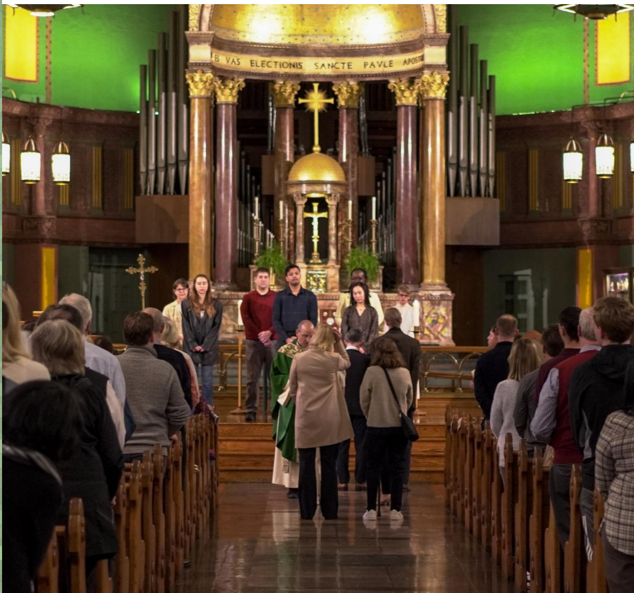
The OCIA Journey Formally Commences: