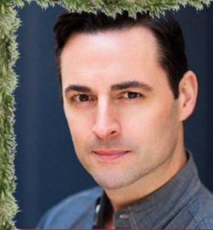
Max Von Essen