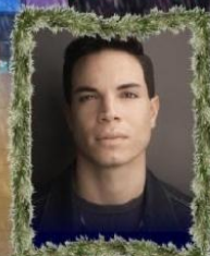
Jason Gotay Gossip Girl

Celebrate the magic that lights up the city at Christmas with 12 Broadway stars, a 25-piece orchestra, and a 70-voice chorus